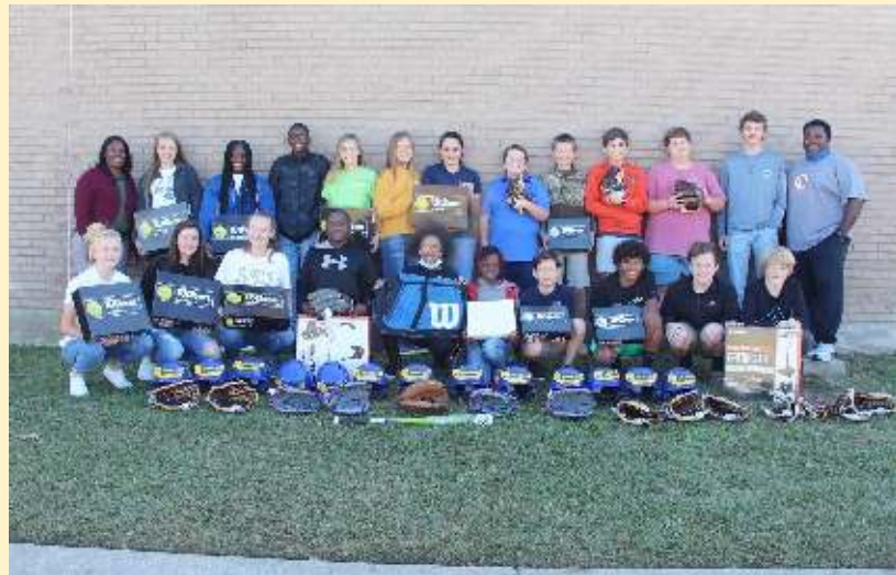
Johnson Board of Education

RBI is a youth outreach program designed to provide access to the game and develop interest in baseball and softball among underserved youth, promote greater inclusion of youth with diverse backgrounds into the mainstream of the game, and increase the number of talented athletes prepared to play in college and professionally.