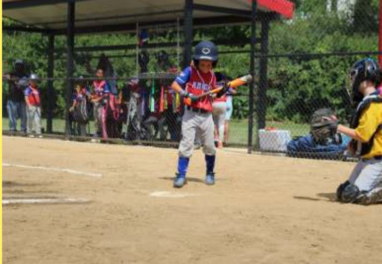
Cincinnati Reds RBI