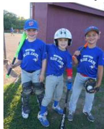
Western Duluth Little League