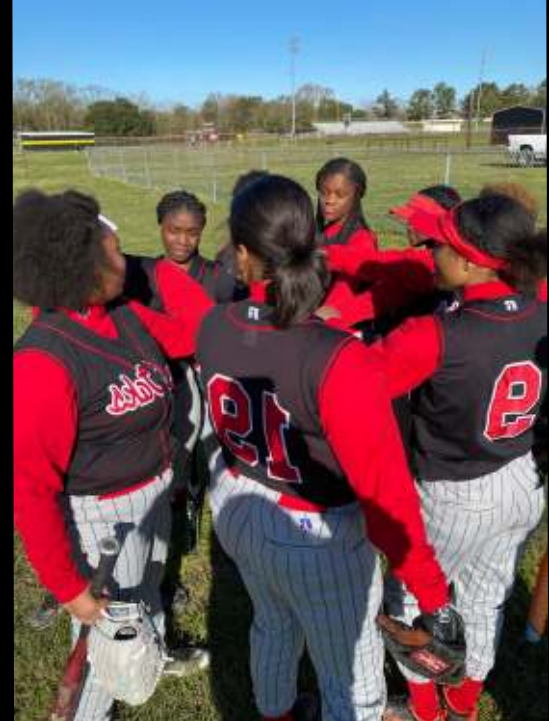
Glen Oaks Magnet High School