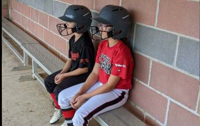
Mohawk Youth Baseball