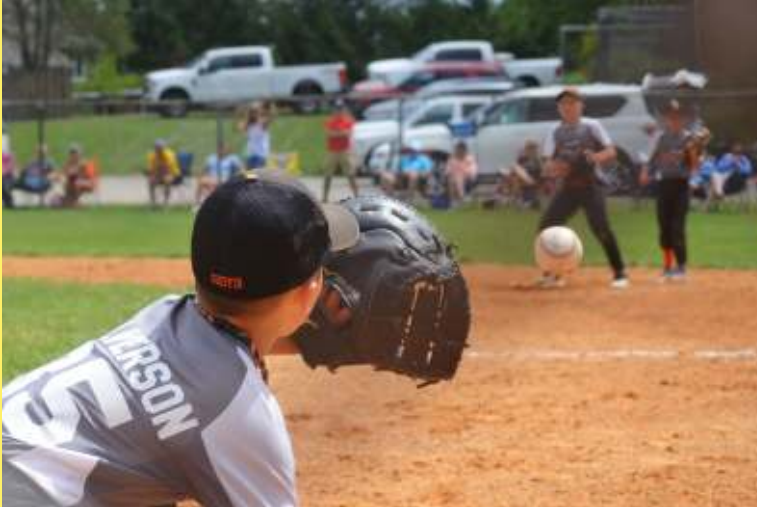
Somerset Little League