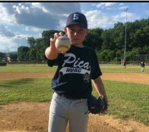
South Scranton Little League

2020 marked the third year of partnership between PIFBS and the Mets. The Mets aim to help support youth baseball and softball in every community they're a part of, and have partnered with PIFBS for projects in New York, Port St. Lucie, and Boca Chica, Dominican Republic. The Mets have invested more than $350,000 to help support youth baseball and softball.