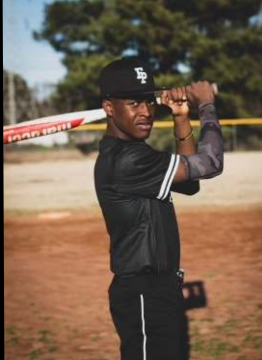
Forest Park High School