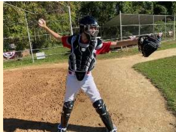
Van Nest Little League

The equipment, valued at $6,000, would benefit approximately 1,200 children across 100 teams in Van Nest Little League in the Bronx, and Half Hollow Hills Little League in Melville, NY.