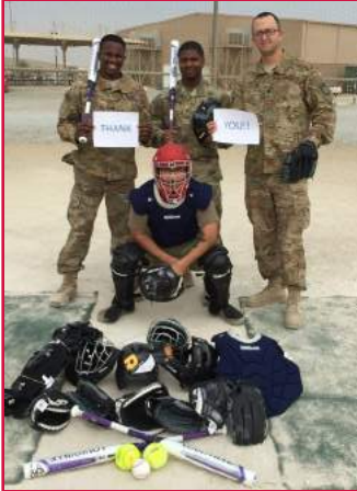
MLB Pitcher Alex Cobb Camp Arifjan, Kuwait

Every so often, PIFB is given an opportunity to send equipment to military personnel serving our country overseas. This year, Rays ace Alex Cobb approached PIFB about sending equipment to troops overseas in honor of his brother who is in the Army. Baseball and softball equipment give troops a much needed outlet for stress relief when they have down time. Additionally, troops are able to introduce baseball and softball to children in the local communities, helping to get kids playing ball that we may not otherwise be able to reach. PIFB was able to send six boxes of equipment to soldiers at Camp Arifjan in Kuwait which will be starting up inner squad leagues in 2017.