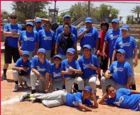
School Based Program with New York Yankees Bronx, NY

This year the Rosebud Boys & Girls Club of the Rosebud Sioux Community in South Dakota, raised enough funds to attend an Inter-Tribal Youth Baseball tournament hosted by the Diamondbacks. With many of the boys having never left their communities, the team was ecstatic about attending but they had limited gear and no uniforms. PIFB was able to provide the team with the necessary equipment for the tournament and the entire Boys & Girls Club with gear as well.