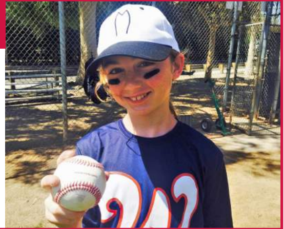
Rosebud Boys & Girls Club Rosebud Sioux Community, SD