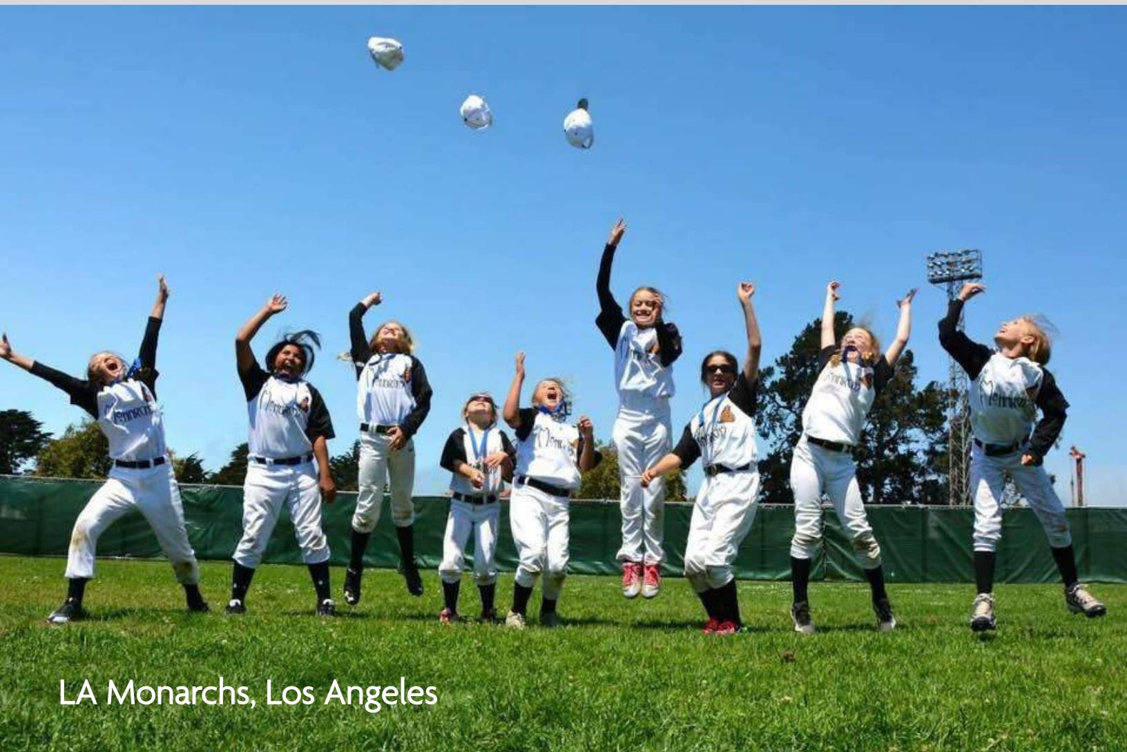
LA Monarchs, Los Angeles